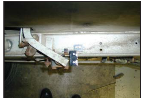
Fig. 2 - Brake Switch Location