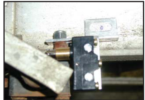
Fig. 3 - Switch Bracket and Drill Location